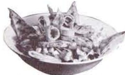
Southwestern Mexican Salad

Chicken or Steak Fajita Salad Marinated strips of chicken or steak, black beans, corn, bell peppers, diced tomatoes, salsa and tortilla strips, toasted in our creamy mexi-ranch dressing . . . $6.99